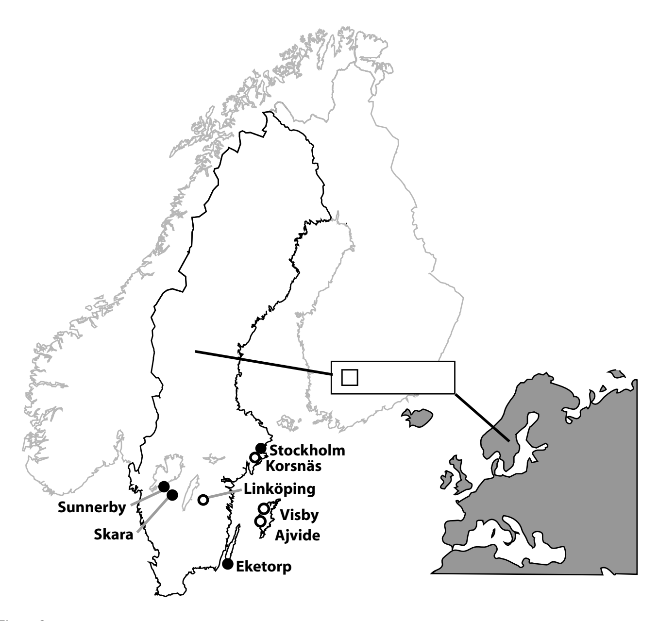
Figure 2 Samples were collected from eight different archaeological localities in southern Scandinavia, four Neolithic (empty circles) and four medieval (black dots).

Scandinavia were of smaller size than those of prehistoric and extant wolves [15,17]. While canid domestication may have occurred in other parts of Europe [18], Scandinavian dogs were likely imported and had experienced a long period of morphological change under human control before they reached the Scandinavian peninsula.