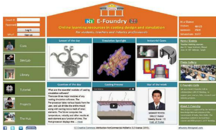
The E-Foundry includes a variety of education tools that are free to all visitors.

The casting model is uploaded to the E-Foundry server, which checks