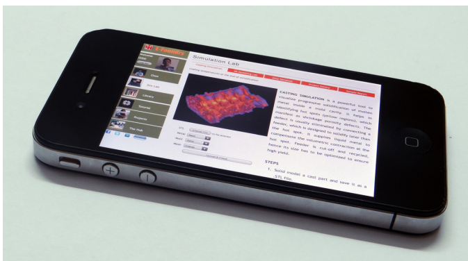
Fig 1. Casting solidification simulation on the 'Cloud'

E-Foundry came up in response to three strongly-felt needs. One is the high cost and deep specialisation associated with casting simulation technology that needs to be democratised. Second is the increasing gap between textbooks and industry practice in casting design and simulation, which has to be filled by contemporary knowledge. Third, novel mechanisms are needed to reverse the declining interest and employability of engineering students in manufacturing sector, especially metal casting. These challenges were addressed by setting up a cloud-based E-Foundry, a computer server in IIT Bombay that can be freely accessed by anyone anytime from anywhere through any computing device connected to the Internet. Major facilities include online simulation, classroom, and library.