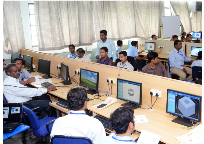
Fig 4. Computer hands-on training for teachers

Since its launch in January 2013, E-Foundry has attracted over 50,000 visitors, each spending 10 minutes on average, and collectively grossing over 300,000 page-views. Nearly 6000 castings have been simulated online so far. Most visitors are from India, USA, Brazil, UK, Pakistan, Germany, Mexico, Italy, Spain, Turkey, China and Australia.