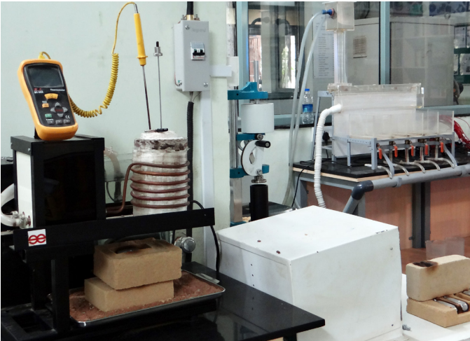
Fig 3. Tabletop casting experiments in E-Foundry Lab